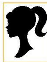
Gold Medal We see YOU here!