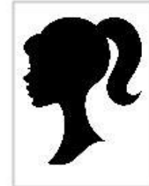
Silver Medal We see YOU here!